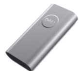
Dell Portable Thunderbolt™ 3 SSD, 500GB (SD1-T0500)(M)