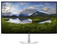
Dell 27 USB-C Ultrathin Monitor - S2719DC