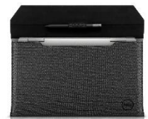
Dell Premier Sleeve - XPS 15